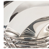
Butler Silver BS