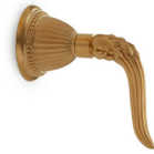
CLASSICAL LEVER VOLUME CONTROL AND DIVERTER TRIM 0932LV-ESC-XX