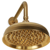
STANDARD RAIN CAN 0848SHHD-XX-XX