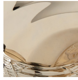
Almond Gold AG