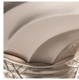
Brushed Nickel BN