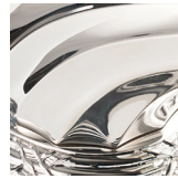
English Silver ES