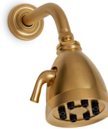
CLASSICAL SHOWER HEAD 0830SHHD-CL-XX