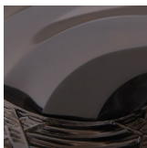
Black Eclipse BE