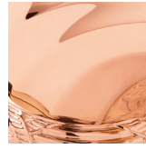
Rose Gold RG