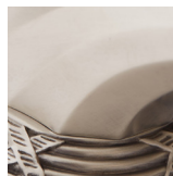
Burnished Platinum BP