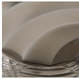
Brushed Chrome BC