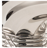
Polished Nickel PN