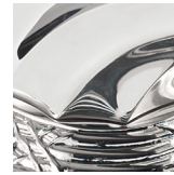
High Polished Platinum HP