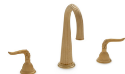
CLASSICAL LEVER BAR FAUCET 0932BAR-821-XX

Available in multiple finishes, spout sizes, and pull/knob sizes. Pulls and knobs can also be made in a back-to-back configuration for shower door use.