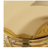
Polished Brass PB