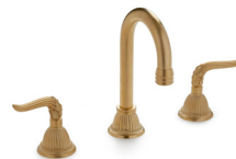
CLASSICAL LEVER BAR FAUCET 0932BAR-800CL-XX