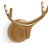
WALL MOUNT CRADLE WITH CLASSICAL ESCUTCHEON 0849WLMT-CL-XX