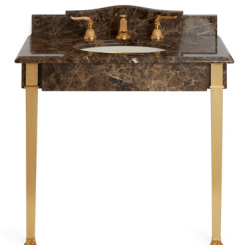
CLASSIC CONSOLE 0250B-UE15-XXXX

Available in multiple finishes, spout sizes, and pull/knob sizes. Pulls and knobs can also be made in a back-to-back configuration for shower door use.