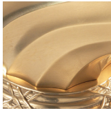
Burnish Gold BG