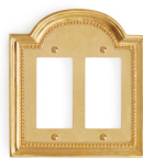
CLASSICAL DOUBLE DECORA/GFI PLATE 0470D-DEC-XX