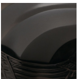
Raven Black RB