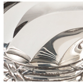
Butler Silver BS