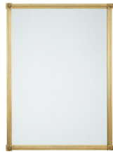
REEDED WITH ROSETTE MIRROR 4256M-XX-XX