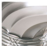
Satin Platinum SP