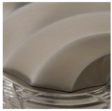
Brushed Chrome BC