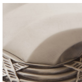
Burnished Platinum BP