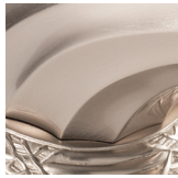
Brushed Nickel BN