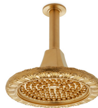
EGG & DART RAIN DOME WITH NOZZLES 0835CS-N-XX