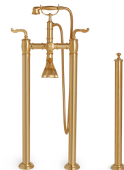
RIBBON & REED LEVER EXPOSED TUB SET 0912XTS-01-XX

Available in multiple finishes, spout sizes, and pull/knob sizes. Pulls and knobs can also be made in a back-to-back configuration for shower door use.