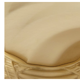
Satin Brass SB