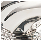
English Silver ES