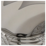
Polished Chrome PC