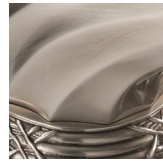
Antique Pewter AP