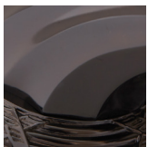
Black Eclipse BE