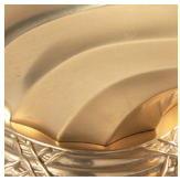
Burnish Gold BG