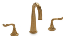
RIBBON & REED LEVER BAR FAUCET 0912BAR-818-XX