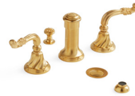
RIBBON & REED LEVER FOUR HOLE BIDET FAUCET 0912BDT-4H-XX