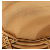
Antique Gold AG