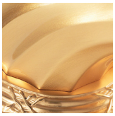
Gold Plate GP