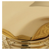
Polished Brass PB