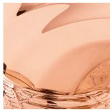
Rose Gold RG