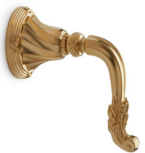
RIBBON & REED LEVER VOLUME CONTROL AND DIVERTER TRIM 0912LV-ESC-XX