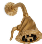
RIBBON & REED SHOWER HEAD 0816SHHD-XX