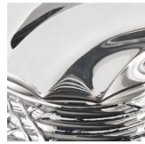
High Polished Platinum HP