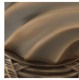
Oil Rubbed Brass OB