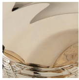
Almond Gold AG