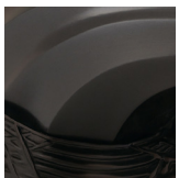
Raven Black RB