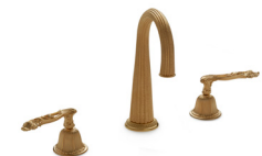
SWIRL LEVER BAR SET 1003BAR-821-XX

Available in multiple finishes, spout sizes, and pull/knob sizes. Pulls and knobs can also be made in a back-to-back configuration for shower door use.