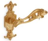
SWIRL DOOR LEVER 1003DOR-RH-XX