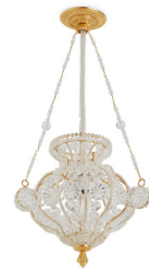
CRYSTAL CHANDELIER WITH ACANTHUS CANOPY 7122AC-XX

Available in multiple finishes, spout sizes, and pull/knob sizes. Pulls and knobs can also be made in a back-to-back configuration for shower door use.